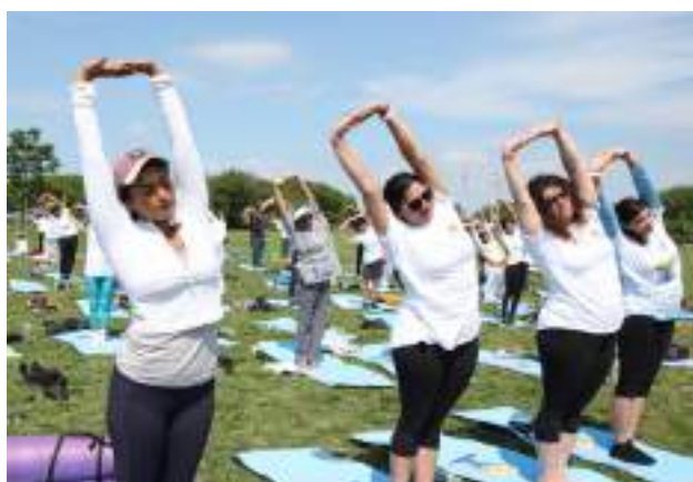
Feel that stretch