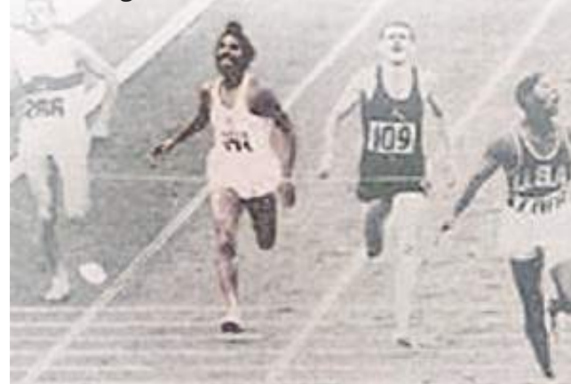
The heart-breaking race during Rome Olympics

Milkha Singh was born in Kot Addu in Muzaffargarh district, now in Pakistan. His