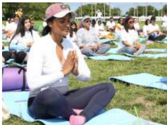
Event host and Former Miss America Nina Davuluri joins the group