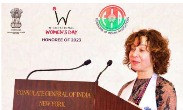
Hon. Meera Joshi addressing the gathering at the IWD

celebrated globally on March 8, is dedicated to the accomplishments and progress of women in all aspects of society and celebrates the social, economic, cultural, and political achievements of women who continue to impact our society. The day also serves as a call to action for the continued fight for gender equality. FIA remains dedicated to the cause of embracing gender equity.