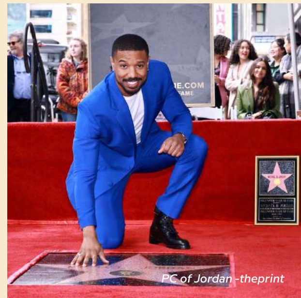
PC of Jordan - theprint