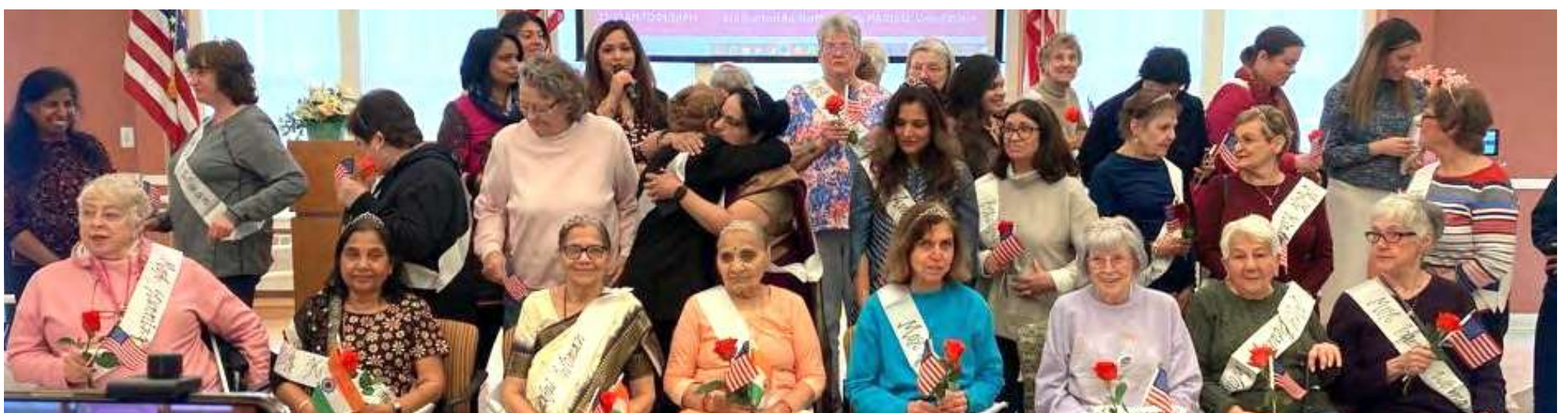
IAFPE and FIA felicitated women with roses and tiaras at the IWD celebration.