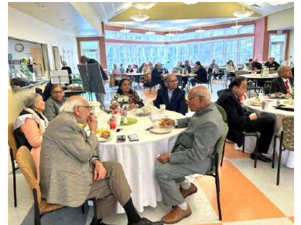
FIA New England, executive team at the IWD and Holi celebration.